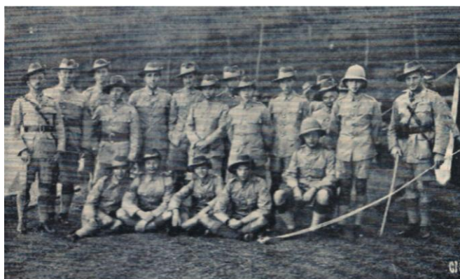
The Anzac Company at camp in 1934 (from the 1954 Centenary Number of The Volunteer )

Named in this paper are but a few of the many Australians in Hong Kong during the Pacific War because of the difficulty in identifying them. Any reader who knows of any other names that should be mentioned is invited to forward the information.